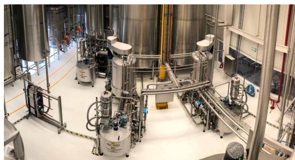
Sucroliq sugar refinement plant in Irapuato (MX)

Sucroliq has a vast experience in satisfying the different needs of their clients. With 3 facilities in Mexico, with an annual production capacity of 350,000 MT of liquid sugar, they are in the process of international growth.