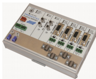
Procentec Fibre / Copper Diagnostic Hub