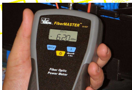
Ideal Networks FibreMaster