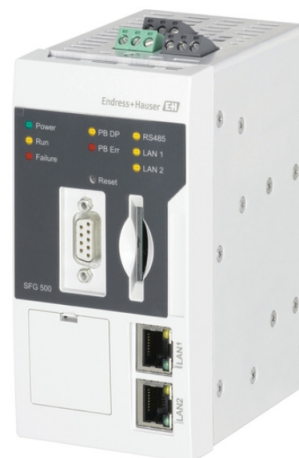
Endress+Hauser FieldGate FDT tool.

The course is available for on-site delivery and at selected locations around the country for up to 12 people (see the training page of our web site for dates).