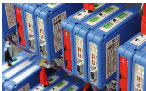
Procentec Combricks Permanent Monitor

Dates and locations of our scheduled courses can be found on the training page of our web site -