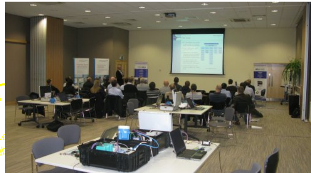
Training facility at Endress+Hauser, Manchester

The course is aimed at the professional engineer level and a basic familiarity with control system terminology and the ability to perform simple engineering calculations is assumed. Attendees must have previously attended the one-day Certified PROFIBUS Installer course.