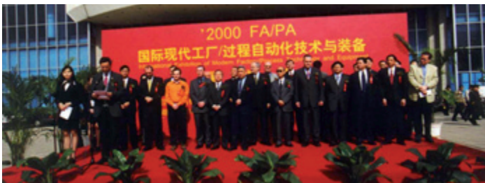
A major step forward came when the Chinese automation market opened up to PROFIBUS technology. Standardization was the key to marketplace acceptance.

The latest region to join the PI community is India. An RPA there is still in formation but the indicators described above are emerging faster than usual. Expect some interesting developments there, particularly on the device front.